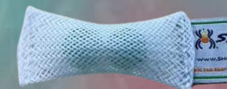
1 Trava dedos