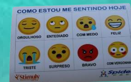
Cartão de Comunicação